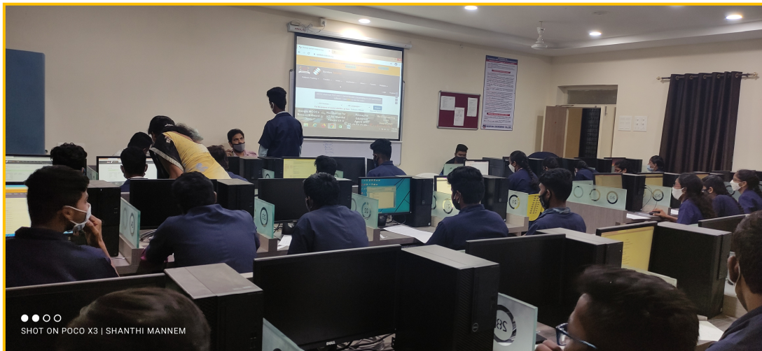
Students are participating in writing online certificate exam

were given by the instructor. After that they gone through how to return type function name, calling a function and how to rectify errors.